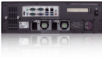
Rear view (above) showing dual Gig-E ports, alarm/relay connections and the dual hot-swap PSU option. Note that the two cooling fans are software controlled and are normally switched off.

The second is the embedded Nx Witness VMS and client application from Network Optix (supplied by Veracity). For details on this option, see the COLDSTORE NX datasheets.