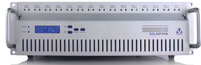
COLDSTORE 3U Pro Front Panel includes LCD system info and disk status LEDs

COLDSTORE 3U PRO is ideal for projects requiring affordable high storage capacity, extended disk lifetimes, long file-retention and simple system management.