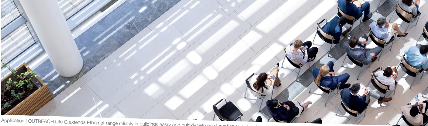
Application | OUTREACH Lite G extends Ethernet range reliably in buildings easily and quickly with no disruption to every day operation.

For more information, read Veracity's 'Long range Ethernet extension' white paper on the Veracity website