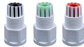
The XT package includes three different compressible glands (black, green and red as above), for different network cable diameters, to ensure a tight seal.

LONGSPAN Max XT camera provides long distance network connectivity with maximum POE to the IP camera in a simple-to-install package