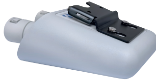
Rear Mounting Plate (removable for easy installation)