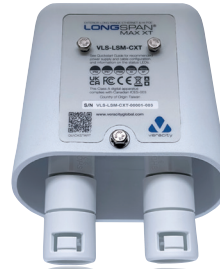
Cable Glands with Conduit Adaptor