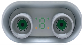
Hidden till lit 7 Segment LED Indicator shows power level and status