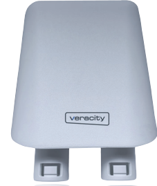
Front View Installed Orientation