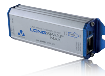
LONGSPAN MAX Base VLS-LSM-B

As LONGSPAN Max XT is designed for external use, there is no direct DC power connection and it must be powered by POE through the network cable.