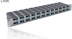
Up to 24 LONGSPAN devices can be mounted in a 1U rack space. Ask for VLS-1U.

Distances may be increased by connecting multiple links in series. Data rate at full range stated: 100Base-TX = 200Mbps, 10Base-T = 20Mbps