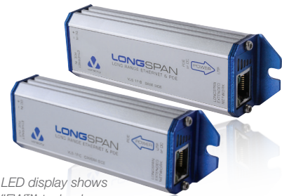
Smart LED display shows SAFEVIEW™ technology.

LONGSPAN delivers unrestricted 100Base-TX with 802.3af and 802.3at POE at distances far beyond the normal Ethernet limits for problem-free IP camera installation.