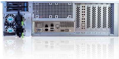
Rear view (above) showing the dual gigabit Ethernet ports, dual hot-swap power supplies and mirrored hot-swap solid state OS disks.

COLDSTORE disk capacity is subject to change. Please check our website for the most up to date disk capacities. www.veracityglobal.com