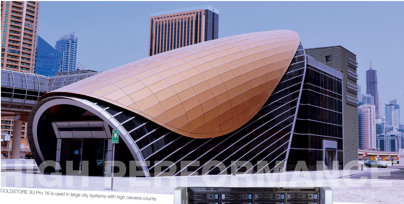
COLDSTORE 3U Pro 16 is used in large city systems with high camera counts