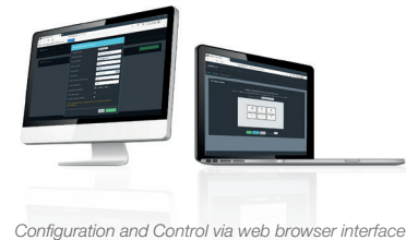
Configuration and Control via web browser interface

systems, allowing network setup, display arrangement and VMS/NVR integration settings. VIEWSPAN can be directly integrated with the VMS or integrated security management system, or can be used as an accelerator platform for the VMS display, controlling multiple VIEWSPAN units on a client through the web browser interface.