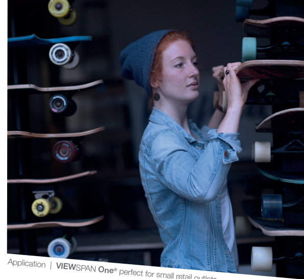
Application | VIEWSPAN One® perfect for small retail outlets

A simple web browser interface is used to configure all VIEWSPAN