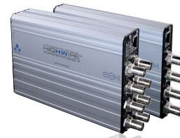
HIGHWIRE Powerstar Base 4 and Base 8

used for any application. Any legacy coaxial cable can be used, or new coaxial cable can be installed, to deliver an extended network that's a rugged, low-cost alternative to fibre. Although designed for 75ohm cable, HIGHWIRE can operate over 50ohm cable with full performance with only a slight reduction in the maximum distance attainable.