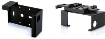
HIGHWIRE Powerstar Duo and Quad