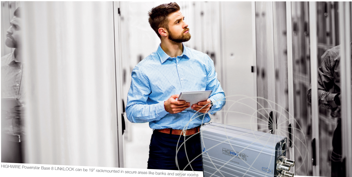
HIGHWIRE Powerstar Base 8 LINKLOCK can be 19" rackmounted in secure areas like banks and server rooms