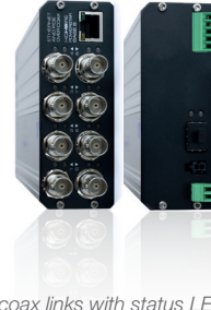
Front | 8 coax links with status LEDs, plus a Gigabit uplink port.