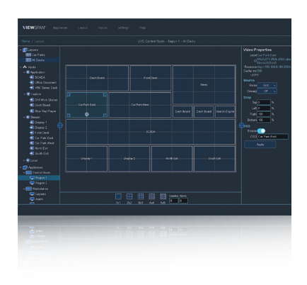
Multiple display screen layouts can be defined, saved and selected under operator control or triggered by alarms

VIEWSPAN incorporates support for popular VMS systems with full integration