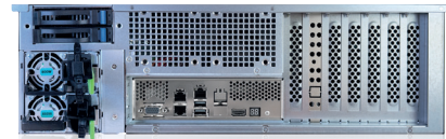
Rear view (above) showing the dual gigabit Ethernet ports, dual hot-swap power supplies and mirrored hot-swap solid-state OS disks.