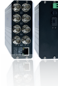
Front | 8 coax links with status LEDs, plus a Gigabit uplink port.