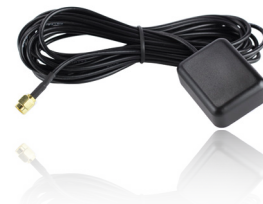
TIMENET Pro comes with antenna and 5 metre cable included.