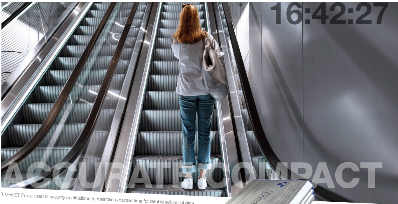
TIMENET Pro is used in security applications to maintain accurate time for reliable evidential data.