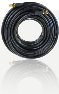
TIMENET Pro Antenna Extension Cable 10 metres