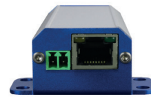
HIGHWIRE Longstar Ethernet and DC input