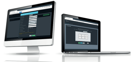
Configuration and Control via web browser interface

Multiple VIEWSPAN ® devices can be integrated to drive large numbers of displays