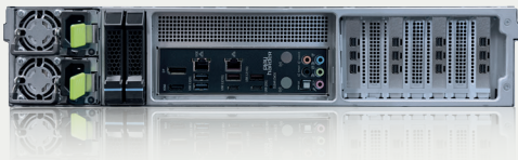
The rear view of VIEWSPAN Plus 12 shows the mirrored, solid-state, 2.5" removable OS drives and the dual hot-swap PSUs. The twelve screen outputs are in four rows on the right. Only the two RJ45 network connectors on the main panel are used (1 x Gb, 1 x 10Gb Ethernet)