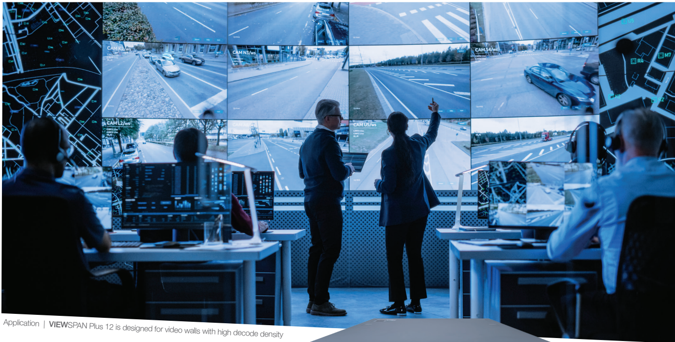
Application | VIEWSPAN Plus 12 is designed for video walls with high decode density