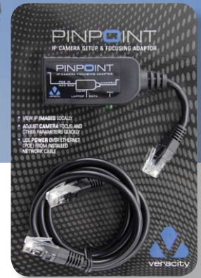
PINPOINT pack comes complete with patch cable.

Veracity's PINPOINT adaptor allows IP video installers to easily set up and focus Power over Ethernet (POE) enabled cameras. No temporary local power source for the camera is required, as PINPOINT enables the camera to draw its power from the installed POE network cabling, whilst re-directing the actual Ethernet network connection to a local laptop, netbook or even PDA.